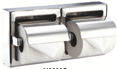
AI0320C Bright finish