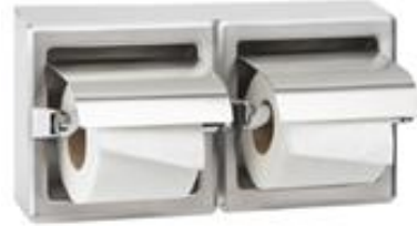
AI0320CS Satin finish