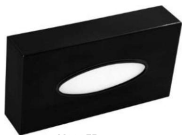
AI0985B Matte black finish