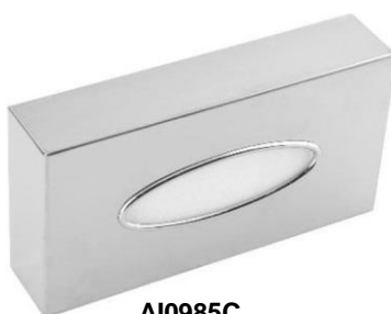
AI0985C Bright finish