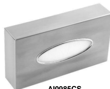
AI0985CS Satin finish