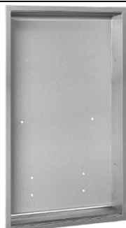
KT0016VCS Satin finish