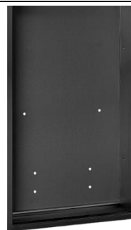
KT0016VCSB Matte black finish