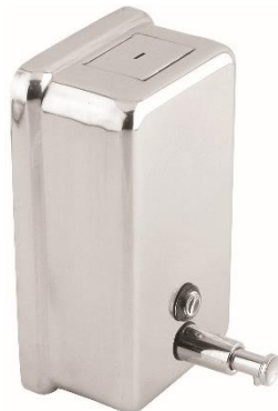
DJ0111C Bright finish