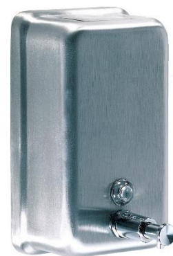
DJ0111CS Satin finish