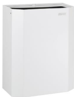
PPA2279 White epoxy finish