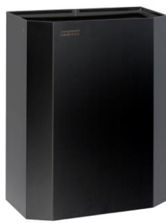
PPA2279B Black epoxy finish