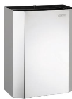
PPA2279CS Satin finish