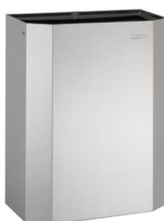
PPA2279C Bright finish