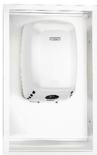
KT009 White finish