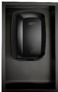
KT009B Black matte finish