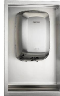
KT009CS Satin finish