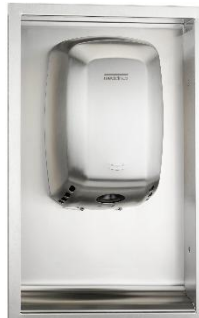
KT009C Bright finish