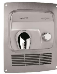
KT0005CS Satin finish