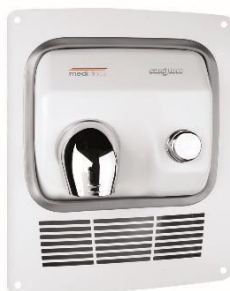
KT0005 White finish