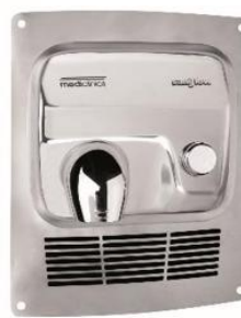
KT0005C Bright finish