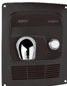
KT0005B Black matte finish