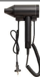
SC0050B black matt finish