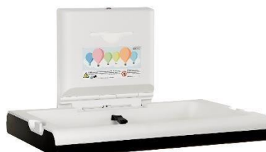
CP0016HCSB Polypropylene /Stainless steel Matte black finish