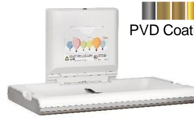
CP0016HCS Polypropylene /Stainless steel Satin finish