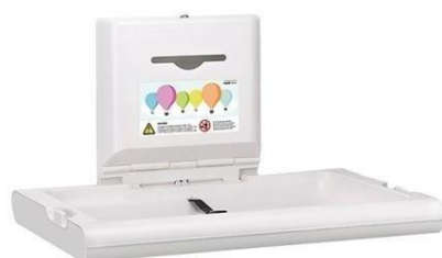
CP0016H Polypropylene White finish