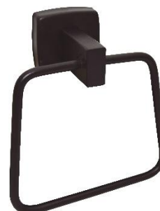
AI0115B Black finish