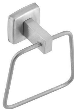
AI0115CS Satin finish