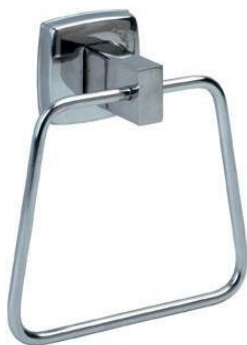
AI0115C Bright finish