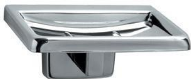
AI0118C Bright finish