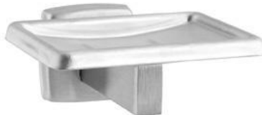
AI0118CS Satin finish