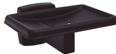
AI0118B Black finish