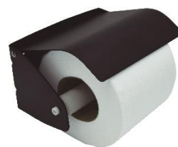
AI0129B Black finish