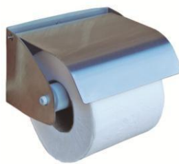
AI0129CS Satin finish