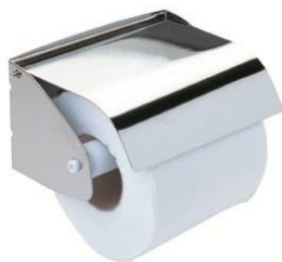
AI0129C Bright finish