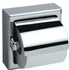
AI0310C Bright finish