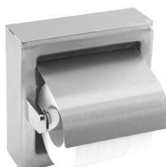
AI0310CS Satin finish