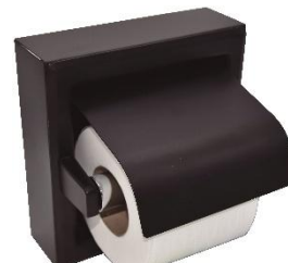
AI0310B Black finish