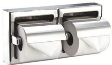
AI0320C Bright finish