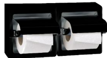
AI0320B Black finish