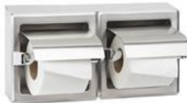
AI0320CS Satin finish