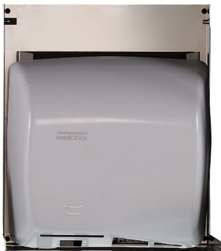
Hand dryer: BTM24 White finish