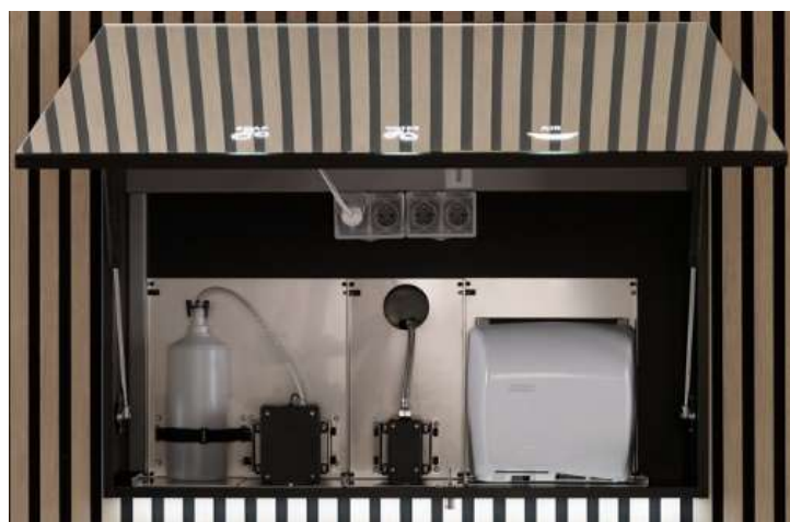
Full set code: BTM02