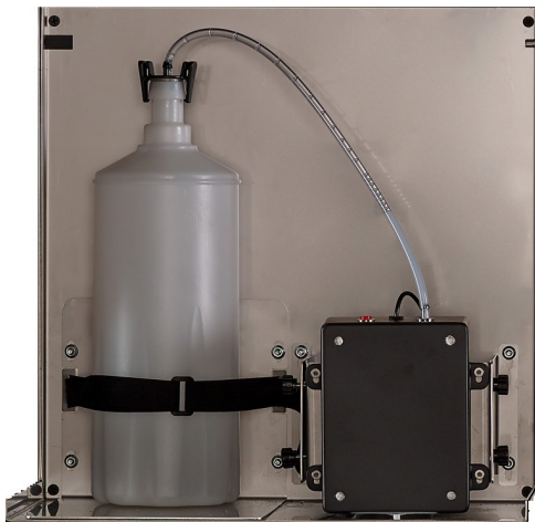
Soap dispenser: DJ024BTM Black finish