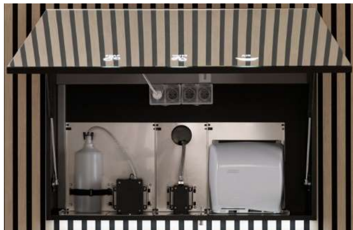
Full set code: BTM02