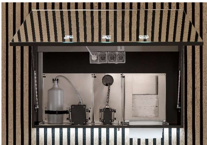
Full set code: BTM03