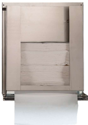
Paper towel dispenser: DT024BTM