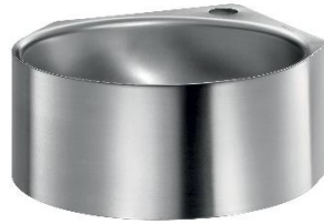
SNLM64CS Satin finish