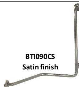
BTI090CS Satin finish