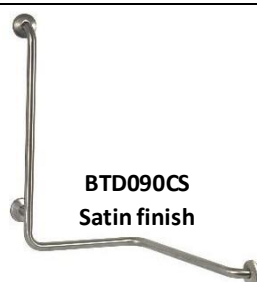
BTD090CS Satin finish