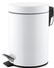
PP1303/PP1305/PP1312/ PP1321 White finish