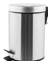
PP1303CS/PP1305CS/PP1312CS/ PP1321CS Satin finish