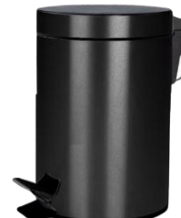
PP1303B/PP1305B/ PP1312B Black finish