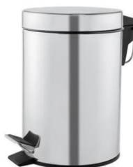
PP1303C/PP1305C/PP1312C/ PP1321C Bright finish