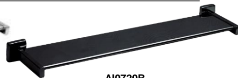
AI0720B Black finish