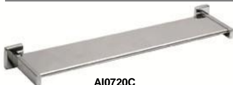
AI0720C Bright finish