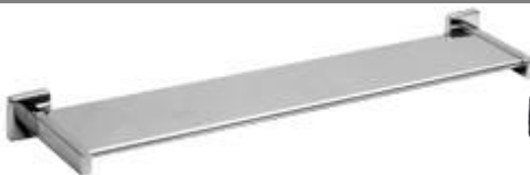
AI0720CS Satin finish