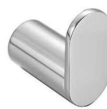
AI1318CS Satin finish