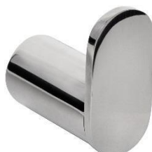
AI1318C Bright finish