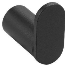
AI1318B Black finish