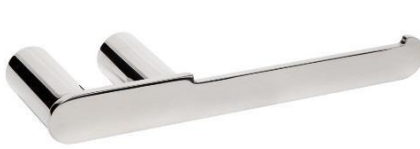
AI1321C Bright finish