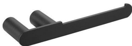
AI1321B Black finish