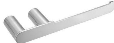
AI1321CS Satin finish