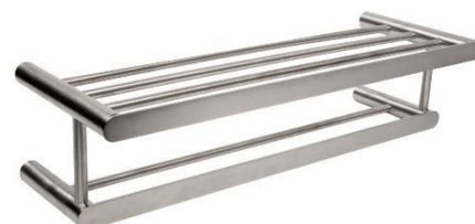
AI1323CS Satin finish