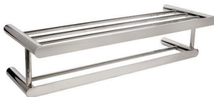
AI1323C Bright finish