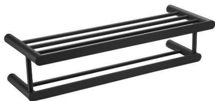
AI1323B Black finish