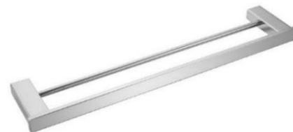
AI1411CS Satin finish