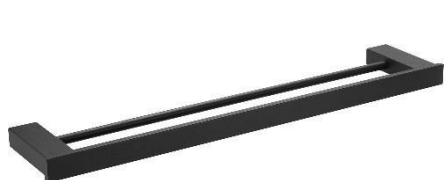
AI1411B Black finish