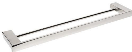
AI1411C Bright finish