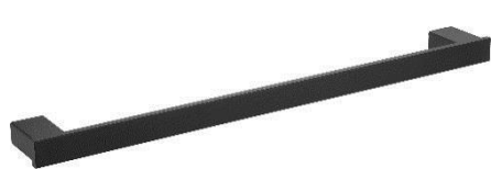
AI1413B Black finish