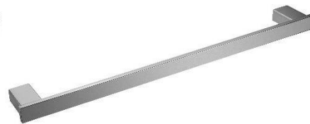
AI1413CS Satin finish