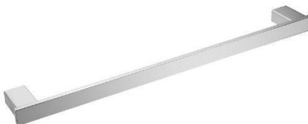
AI1413C Bright finish