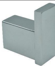
AI1418C Bright finish