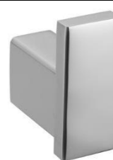
AI1418CS Satin finish