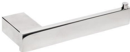
AI1421C Bright finish