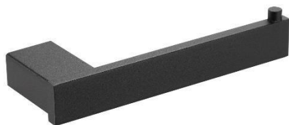
AI1421B Black finish