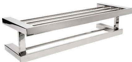
AI1423C Bright finish