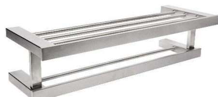
AI1423CS Satin finish