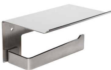
AI2003C Bright finish