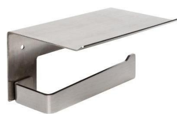
AI2003CS Satin finish