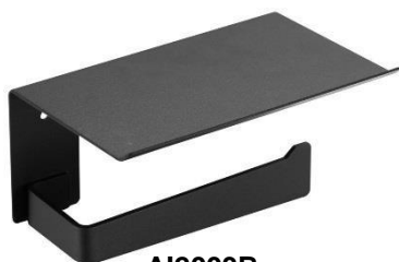
AI2003B Black finish