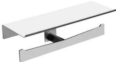
AI2004C Bright finish