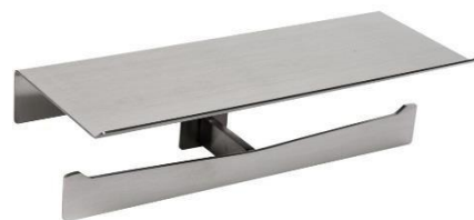
AI2004CS Satin finish