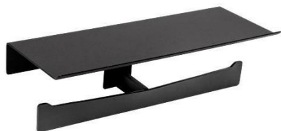
AI2004B Black finish