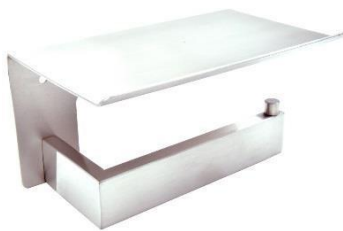
AI2005C Bright finish