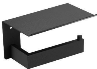
AI2005B Black finish