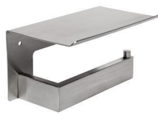
AI2005CS Satin finish