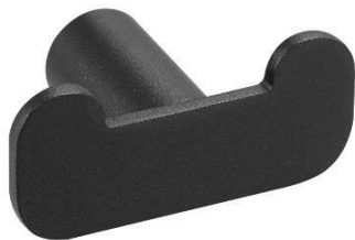
AI2318B Black finish