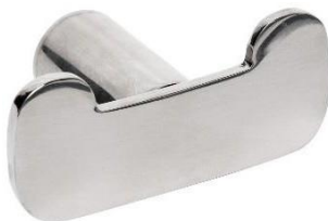
AI2318C Bright finish