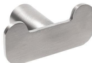
AI2318CS Satin finish