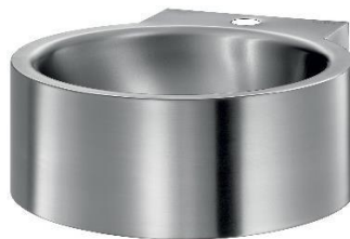
SNLM62CS Satin finish