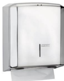
DT2106C Bright finish