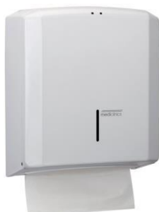
DT2106 White epoxy finish