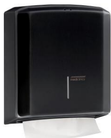
DT2106B Black epoxy finish