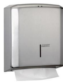
DT2106CS Satin finish