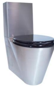
SN0120CS Satin finish