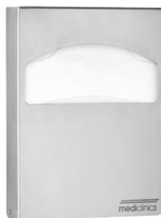
DCA100CS satin finish