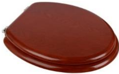
TP0140 Mahogany finish