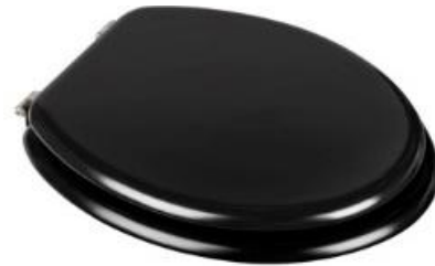
TP0145 Black finish