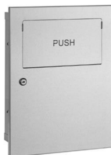
PPE0035CS Satin finish