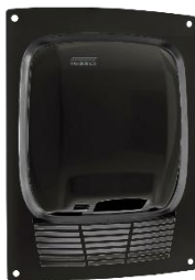
KT0010B Black finish