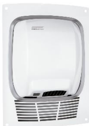
KT0010 White finish