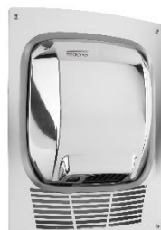
KT0010C Bright finish