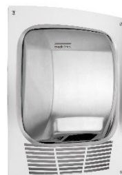
KT0010CS Satin finish