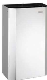
PPA4279C Bright finish