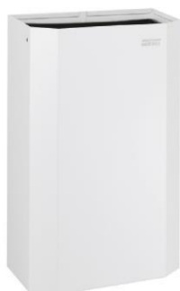
PPA4279 White finish