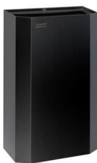
PPA4279B Matte black finish