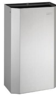
PPA4279CS Satin finish