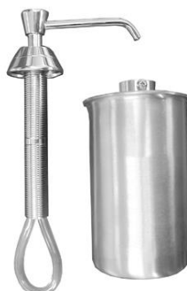
DJ0120C Bright finish